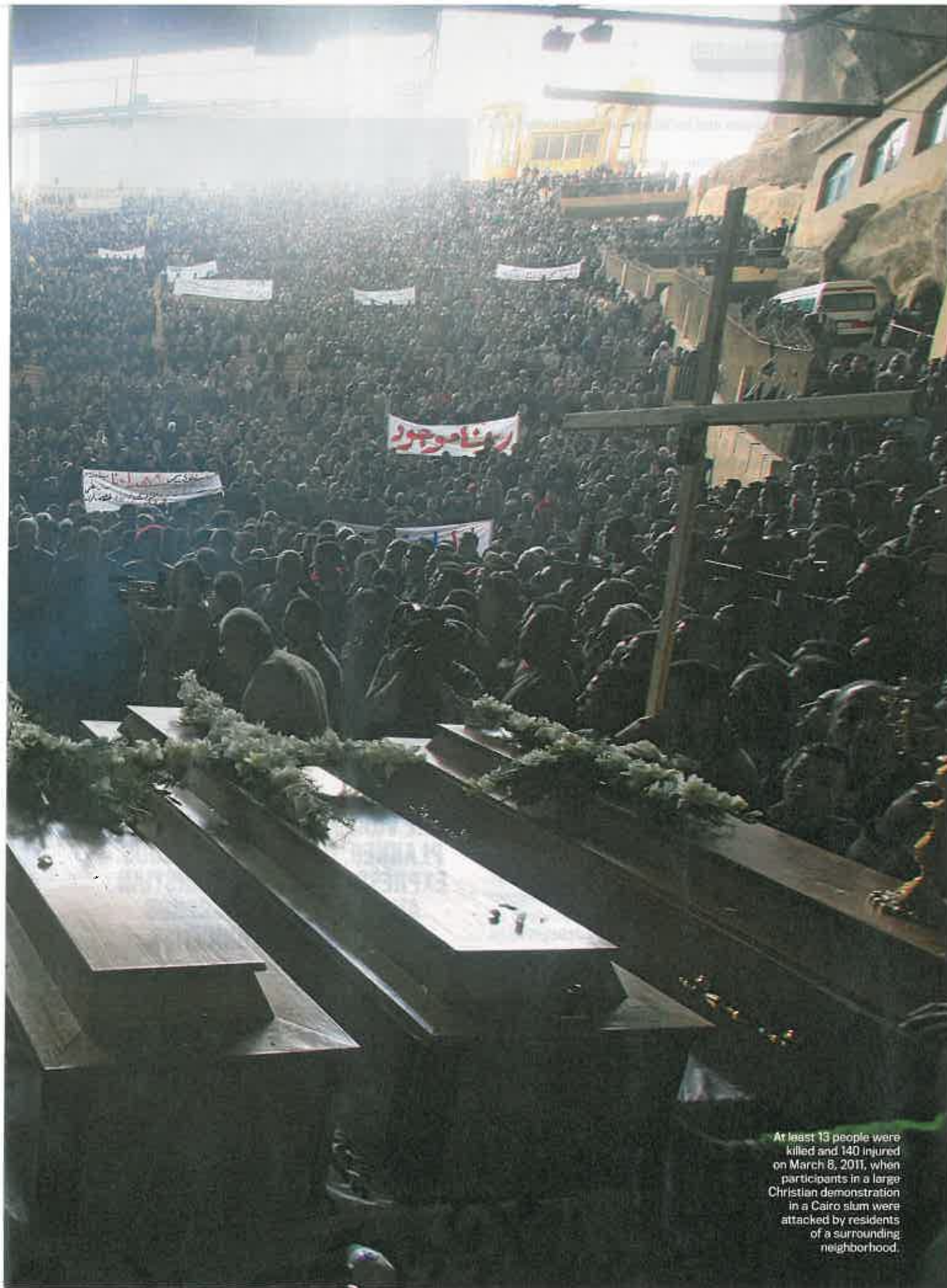
At least 13 people were killed and 140 injured on March 8, 2011, when participants in a large Christian demonstration in a Cairo slum were attacked by residents of a surrounding neighborhood.