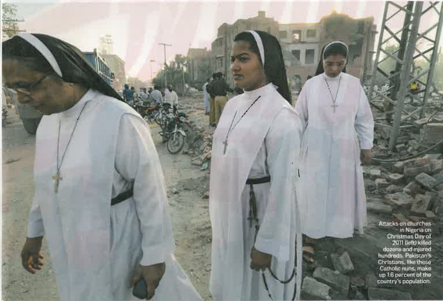
Attacks on churches in Nigeria on Christmas Day of 2011 (left) killed dozens and injured hundreds. Pakistan's Christians, like these Catholic nuns, make up 1.6 percent of the country's population.