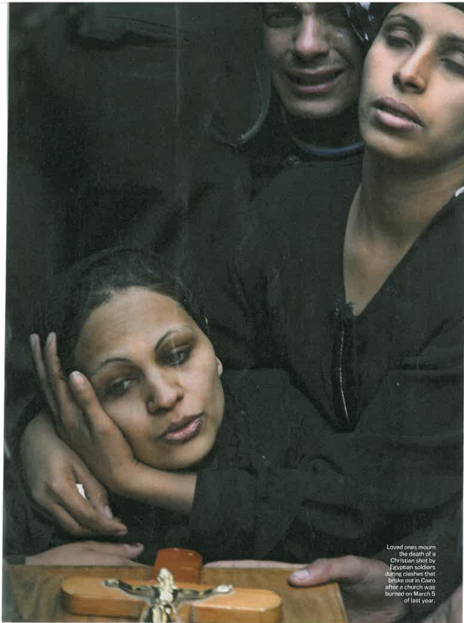
Loved ones mourn the death of a Christian shot by Egyptian soldiers during clashes that broke out in Cairo after a church was burned on March 5 of last year.