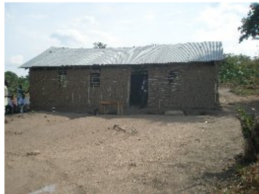
Mud hut church building that has been in use the last three years and will be replaced in time by a brick structure