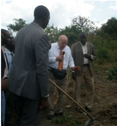
Me having the groundbreaking prayer before the direct was moved for the first time