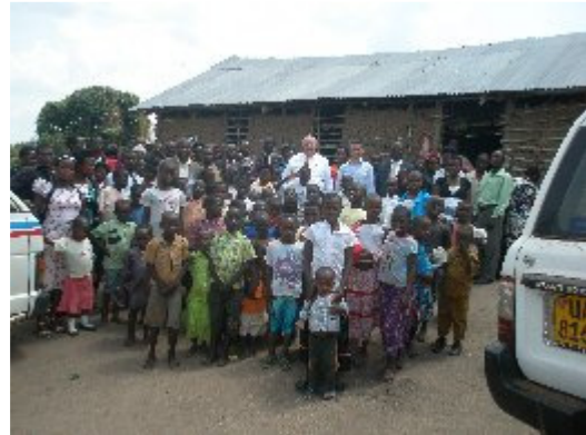
Most of the Nyanzi church family after all the events of the day were over